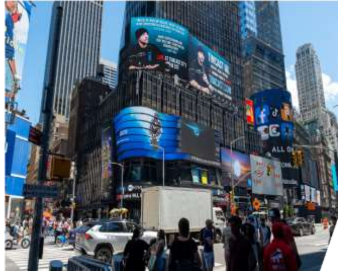
THE DYNAMIC DUO