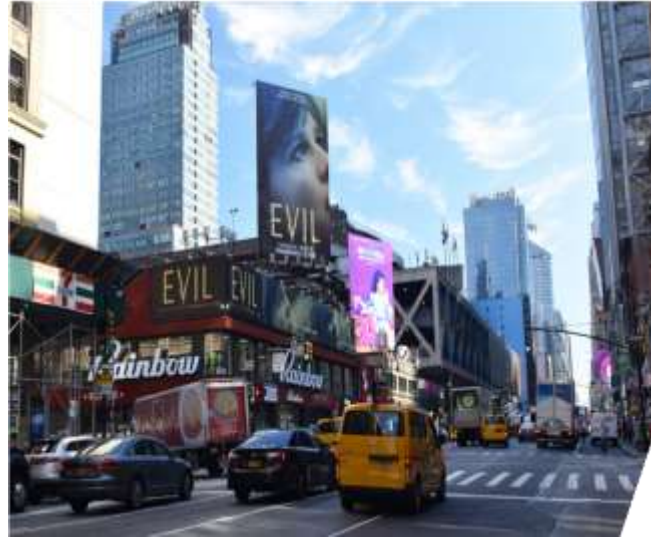
M7321 & M-370